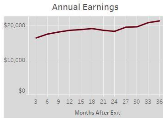
In the three years after leaving WIOA Youth, employed individuals earned $16,300 to $21,200 per year (Statewide, Overall).