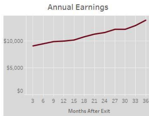
In the three years after leaving VR Youth, employed individuals earned $9,100 to $13,900 per year (Statewide, Overall).