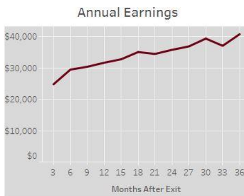
In the three years after leaving Community College, employed individuals earned $24,800 to $40,800 per year (Statewide, Overall).